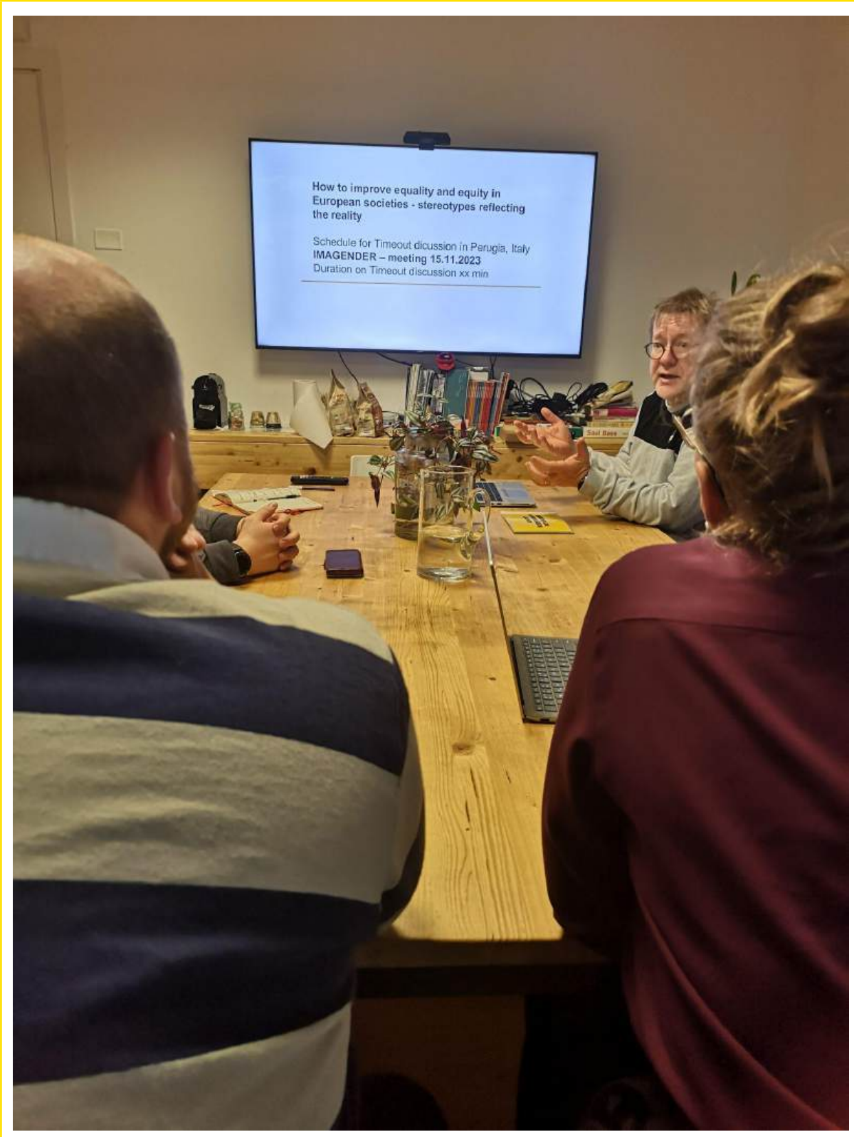
IMAGEnder transnational meeting, November 2023, Perugia - Debate activity testing