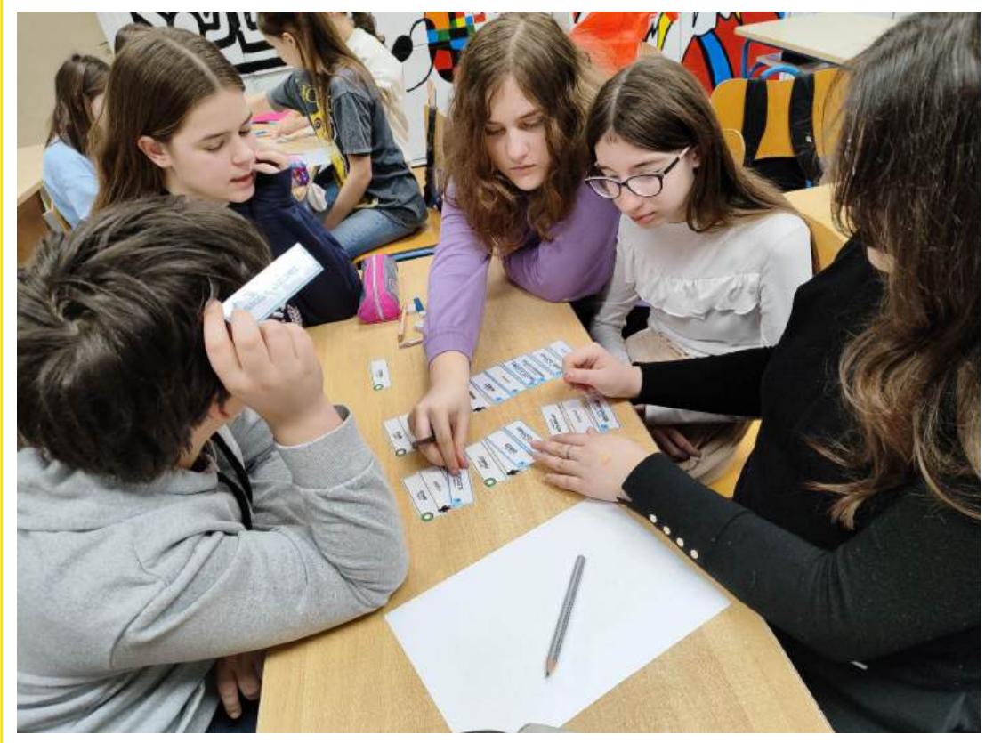
OSDC's students are testing IMAGENDER activities during one of the multipliers event

IMAGENDER would therefore address the theme of gender stereotypes and their representation in audiovisuals. The aim of the project is the experimentation of image education programmes, scalable and modulable, aimed at developing methods and tools useful for tackling gender stereotypes. Through the strengthening of students' skills in audiovisual languages, both in terms of the acquisition of knowledge and critical skills and in relation to the use of the relevant techniques.