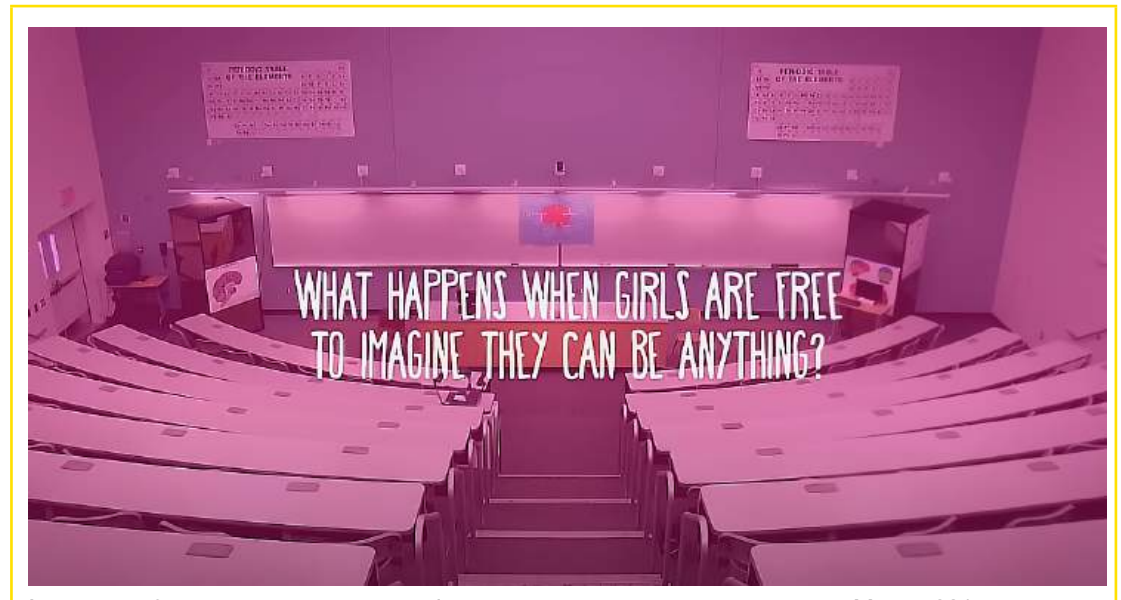
A snapshot from the video campaign "Imagine the possibilities" produced by Mattel, 2015

The European Parliament in its Strategic engagement for gender equality, mentions the under-representation of women in news and information related to the perpetuation of stereotypes that affect the image of women and men. It also points out that, although there is an increased sensitivity to gender issues, a stereotypical representation of women within advertising and audiovisual products continues to be consistent, through the portrayal of women with conformist bodies, often objectified and infantilised, playing roles in line with society's ingrained expectations. All of these elements also reinforce dynamics of self-stereotyping resulting in a loss of self-confidence, when people think not to be consistent with the proposed image.