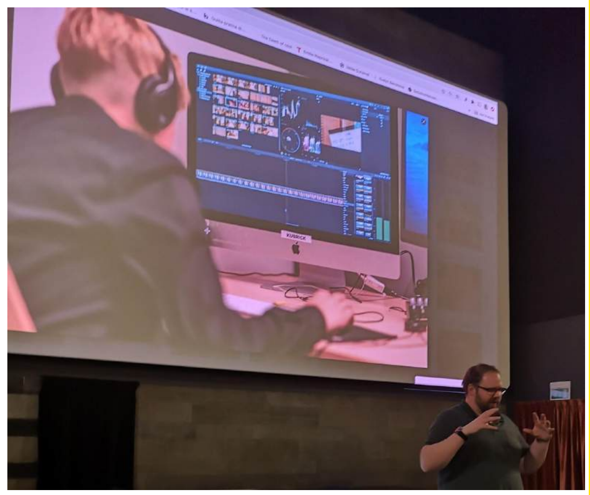
CNEMA reporting during Transnational Meeting in Perugia

Starting from the study of different national contexts and collecting best practices throughout Europe, IMAGENDER contributes to contrast gender stereotypes among young EU citizens promoting new educational programmes of acknowledgement and critical perspective. This booklet is available for all teachers and educators, in order to gather the invitation of the EU Commission to exchange best practices and strive for convergence and upward harmonization of women's rights in Europe.