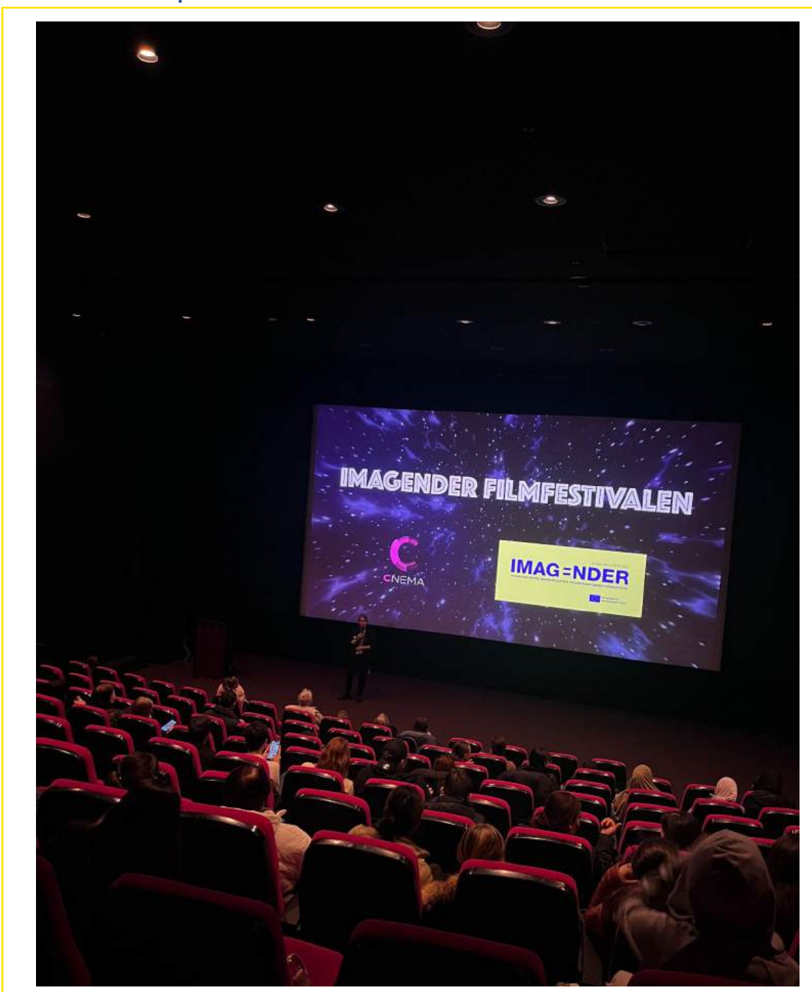
IMAGEnder multiplier event at CNEMA

Work session involved local teachers and students who took part in the very first test of activities, giving important feedback to the team. The result of the entire process is attached to this report.