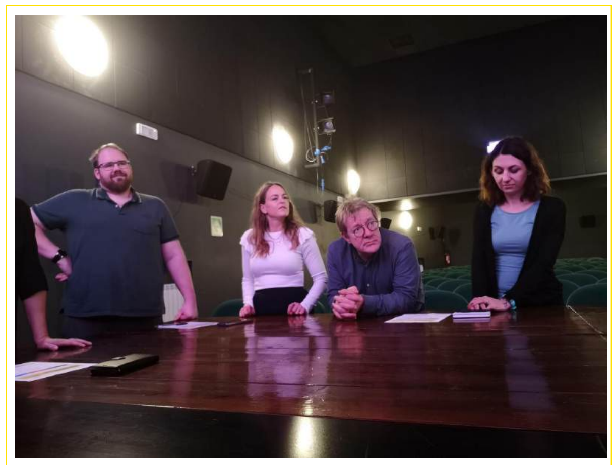
IMAGEnder transnational meeting, November 2023, Perugia - Prototyping activities

The setting of initial priorities should go hand in hand with professional development for senior leadership teams as well as teaching staff. This is the reason why, IMAGENDER promotes confrontation among teachers, school's principals and educators. In November 2023, in Perugia (IT), IMAGENDER partners attended an International Training Meeting, where they compared and discussed different experiences and developed practical tools for teachers and educators which can help them to drive meaningful activity to debate on stereotypes starting from audiovisual support.